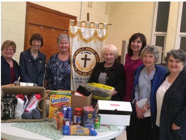
St. Francis Xavier CWL collection of socks for homeless and foodbank