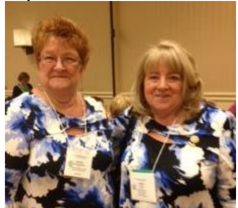
Twins?? How uncanny that these two lovely ladies wore the same dress!