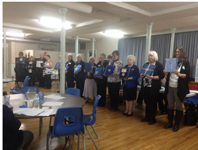
Blessing of the parish councils Books of Life