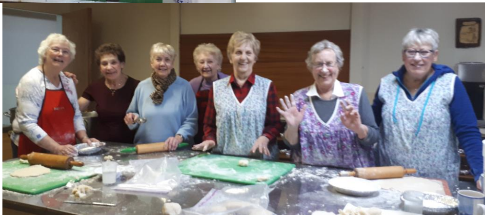
Volunteers from the CWL Tourtière Fundraiser. Quite a fun day for our group. Our next event will be held on February 7th, a Valentine Dessert Card Party from 7 to 9 pm. This is an annual event, that attracts a crowd of about 60 to 70 card players.