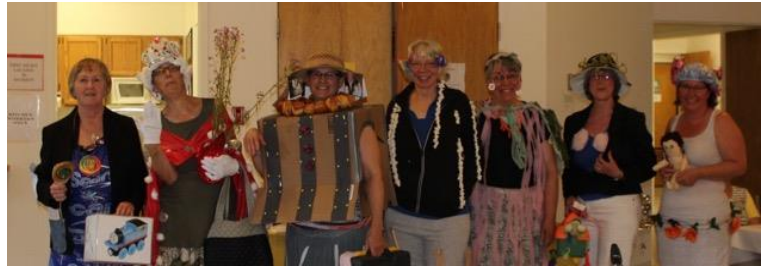
Fashion show at June Potluck dinner