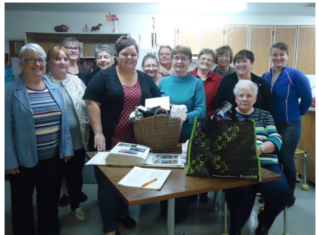
St. Anne's Parish CWL invited representatives from L'EntourElle, a local women's shelter, as guest speakers at our Fall meeting - they were presented with a donation of new socks and non-perishable food items to help them with their supplies at the shelter - they were very appreciative of this act of charity.