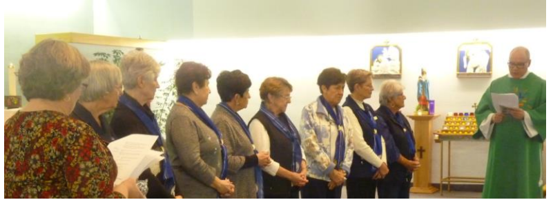
Installation of new executive for 2019-2020